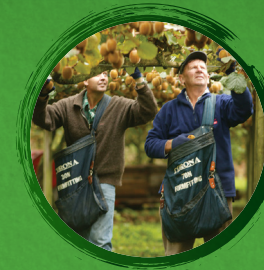
LOWER NORTH ISLAND